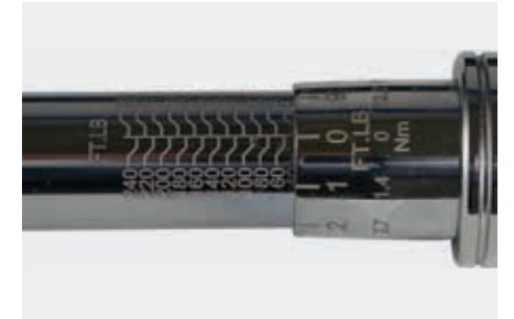
The spring-loaded positive Lock Ring easily and securely sets the torque value. The laser-etched torque scales are clearly