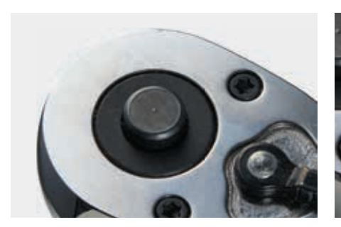
The Quick Release Button, conveniently located near the drive, easily engages and disengages the socket from the drive and provides strong socket retention.